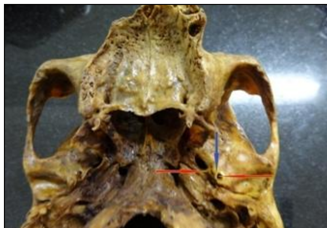
FIG. 4: BLUE ARROW INDICATES BONY SEPTUM DIVIDING THE FORAMEN SPINOSUM, RED ARROW INDICATES DUPLICATION OF FORAMEN SPINOSUM

Carotid Canal: The size and dominance (in terms of size) of the carotid canal are significant due to important contents passing through it. The dimensions of the canal in the present study were found to vary between right and left side with significant statistical significance (Table 3).