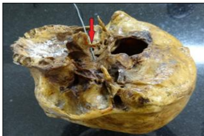
FIG. 2: THE ARROW POINTS TO THE OSSIFIED PTERYGOSPINOUS LIGAMENT

The Foramen Spinosum: The foramen spinosum was present bilaterally in 90% of the skulls studied. However, in one out of the 64 skulls we noticed bilateral absence of this foramen (Fig. 3) and in one