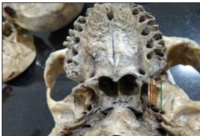
FIG. 5: WHITE ARROW INDICATES UNILATERAL PRESENCE OF LEFT FORAMEN VESALIUS LOCATED MEDIAL TO THE DUPLICATED FORAMEN OVALE ORANGE ARROW GREEN ARROW INDICATES FORAMEN SPINOSUM

Foramen Lacerum: Present study observed bilateral presence of this foramen in all the 64 skulls ( Table 5 ).