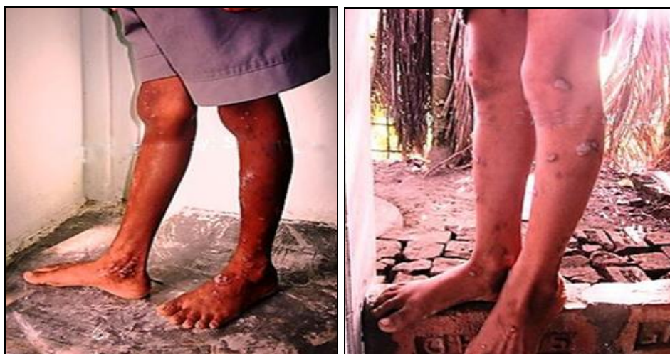
FIG. 1: ARSENOCOSIS PATIENT