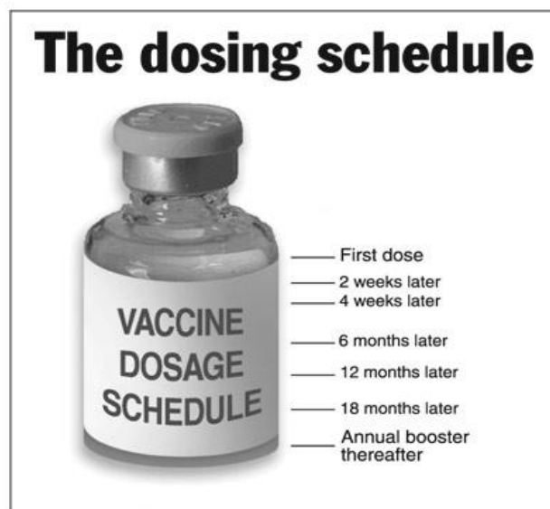
FIG. 2: THE DOSING SCHEDULE OF POLIO VACCINE

Other historical treatments for polio include hydrotherapy, electrotherapy, massage and passive motion exercises, and surgical treatments, such as tendon lengthening and nerve grafting. Devices such as rigid braces and body casts-which tended to cause muscle atrophy due to the limited movement of the user-were also touted as effective treatments 48 .