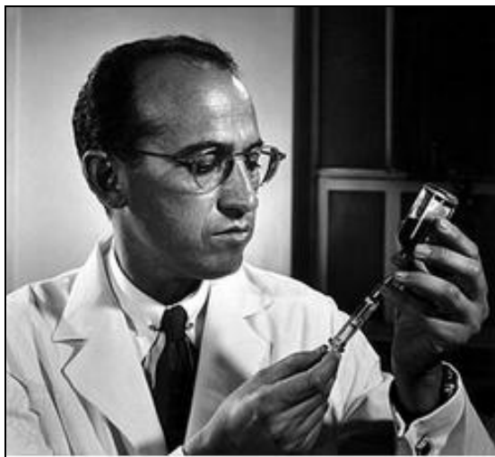
FIG. 1: Dr. JONAS SALK- INVENTOR OF POLIO VACCINE

By 1910, much of the world experienced a dramatic increase in polio cases and epidemics became regular events, primarily in cities during the summer months. These epidemics-which left thousands of children and adults paralyzed-provided the impetus for a "Great Race" towards the development of a vaccine. Developed in the 1950s, polio vaccines are credited with reducing the global number of polio cases per year from many hundreds of thousands to today under a thousand. Enhanced vaccination efforts led by Rotary International, the World Health Organization, and UNICEF should result in global eradication of the disease 4 .