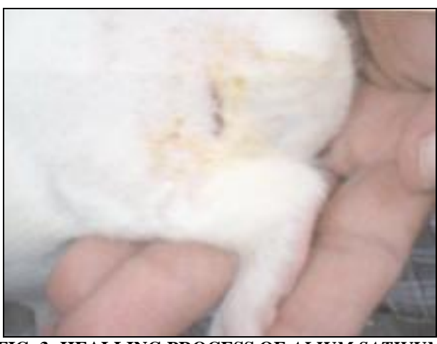
FIG. 3: HEALLING PROCESS OF ALIUM SATIVUM