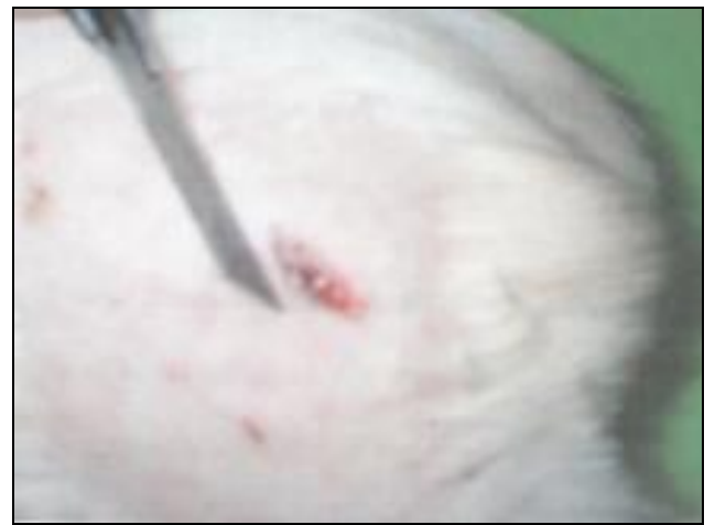
FIG. 1: ARTIFICIALLY INDUCED WOUND.