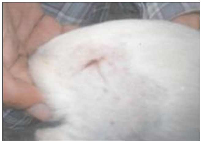
FIGURE 5: HEALLING PROCESS OF NEBANOL POWDER