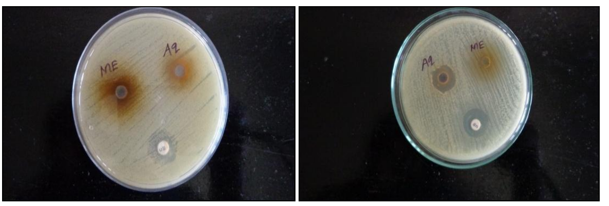
1.3 S. aureus