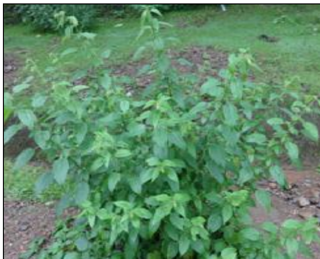
FIG. 1: A COMPLETE NETTLE PLANT IN ITS HABITAT AT DAL LAKE, PALAMPUR

Roots: extensive underground network of hard winter rhizomes, fibrous roots produced along with rhizomes.