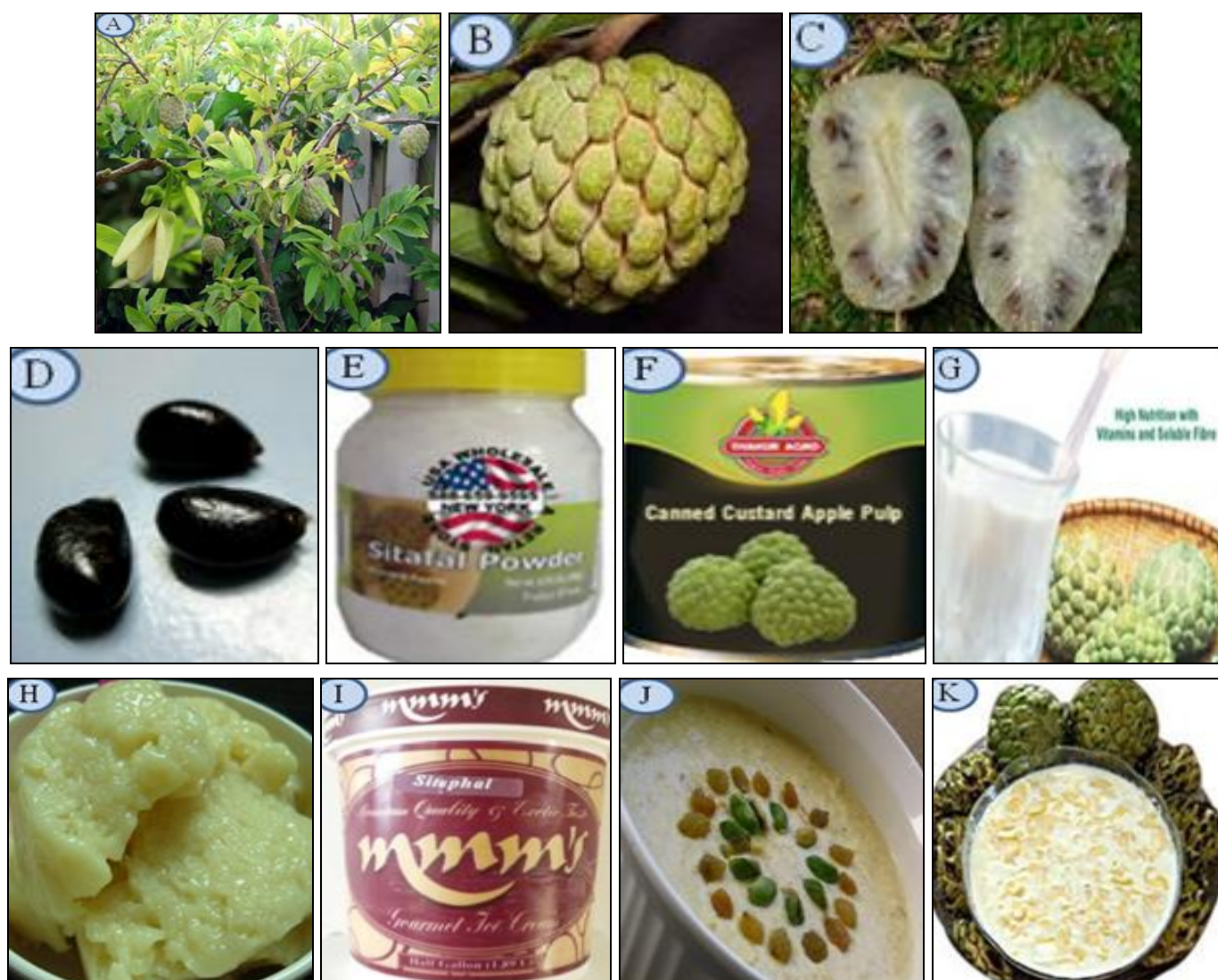
FIG. 1: ANNONA SQUAMOSA LINN. PLANT: (A) LEAVES, STEM, FLOWERS AND FRUITS; (B) MATURED FRUIT; (C) PULP; (D) SEEDS; (E) DRIED FRUIT POWDER; (F) CANNED PULP; (G) FRUIT SHAKE; (H-I) SITAPHAL ICE-CREAM; (J) SITAPHAL RABDI; (K) SITAPHAL KHEER

Sitopaladi churna is an ayurvedic medicine for cough and cold and sneezing nose. Administration of the aqueous extract of the leaves also improved the activities of plasma insulin and lipid profile and reduced the levels of blood glucose and lipid peroxidation, indicating that the high levels of triglyceride and total cholesterol associated with diabetes can also be significantly managed with the extract. The bark leaves and roots of some species are used in folk medicines. The strong bark is used for carrying burdens in the Amazon Rainforest and for wooden implements, such as tool handles and pegs 7 . The wood is valued as firewood yellow and brown dyes 8 .