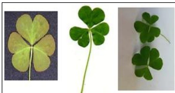
FIG. 3: MACROSCOPIC OBSERVATION OF OXALIS CORNICULATA

Leaf: Trifoliate; its petiole is green, slender, and heart-shaped and leaflets are 1-2cm long with reticulate venation, sour taste and alternately placed along the stalk 29 Fig. 3 and Fig. 4.