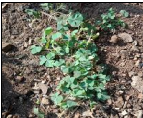
FIG. 1: OXALIS CORNICULATA WHOLE PLANT

Since, orthodox medicine is limited, expensive, and has adverse side effects, the world's inhabitants have faith in traditional medicine 6 . Herbal medicines are thought to be risk-free and non-hazardous to the body than manufactured pharmaceuticals on a global scale. As a result, research facilities are examining plants for potential medicinal biological processes. The traditional Indian medical system recommends using herbal treatments to cure a variety of illnesses 7 . Unique medicinal herb, Oxalis corniculata Linn., family Oxalidaceae, Fig. 1 is origin of India that has a wide range of biological activities, extensively referred as creeping wood sorrel, a remarkable plant with composition of all essential components for individual's good health 8 .