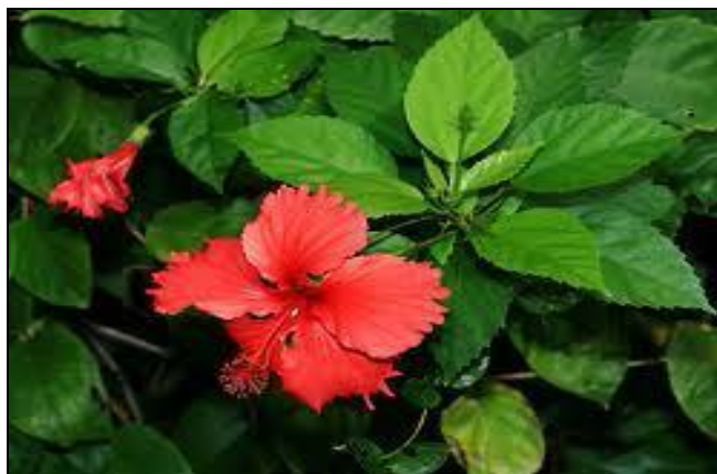
FIG. 14: HIBISCUS ROSA SINENSIS

Treatment with the aqueous extract of H. rosa sinensis (500 mg kg -1 ) aerial part reduced the blood glucose level, urea, uric acid and creatinine but increased the activities of insulin, C-peptide, albumin, albumin/globulin ratio and restored all marker enzymes to near control levels of streptozotacin-induced diabetic rats. Thus, it exhibited an antihyperglycaemic effect and consequently may alleviate liver and renal damage associated with streptozotacin-induced diabetes mellitus in rats 23 .