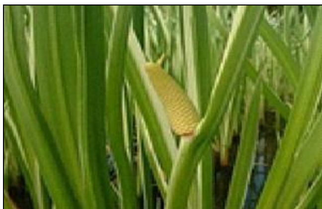
FIG. 2: ACORUS CALAMUS

Oral administration of methanolic extract of A. calamus rhizome restored the levels of blood glucose in Streptozotocin induced diabetic rats after 21 days. Further, lipid profile (total cholesterol, LDL and HDL-cholesterol), glucose 6-phosphatase, fructose 1,6 bis Phosphatase levels and hepatic markers enzymes (aspartate aminotransferase, alanine aminotransferase, alkaline phosphatase) were decreased 2 .