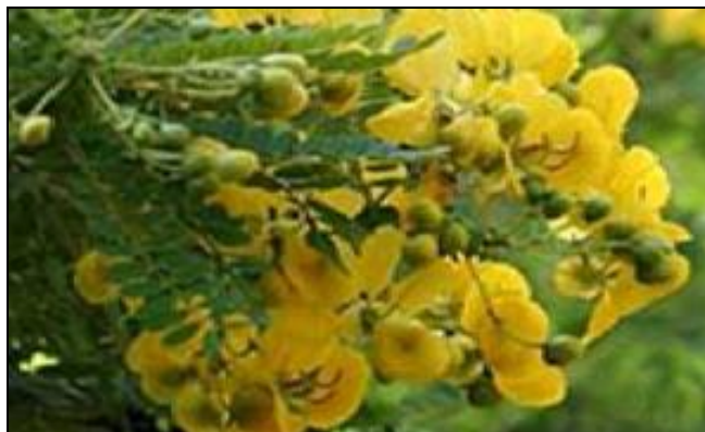
FIG. 11: SENNA AURICULATA