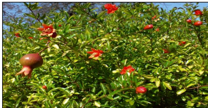
FIG. 18: PUNICA GRANATUM

A shrub or small tree grows wild in the warm valleys and outer hills of the Himalayas and also cultivated throughout India. The flowers of Punica granatum are used as anti-diabetic in Unani medicine called Gulnar farsi. Oral administration of aqueous-ethanolic extract (50% v/v) led to significant blood glucose lowering effect in glucose fed hyperglycemic and alloxanized diabetic rats with the maximum effect at the dose of 400-mg/kgbody weight 30 . Anti-oxidant activity has been described in the literature 31 .