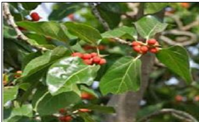
FIG. 15: FICUS BENGHALENSIS

The leaves contain 9.63% crude protein, 26.84% crude fibres, 2.53% calcium oxalate and 0.4% phosphorous. The various qualitative chemical tests of ethanol extract and aqueous extract of leaves contain sterols, flavanoids, phenol, tannins, and saponins in large amount whereas aromatic acids, carbohydrates, triterpenoids, gums, mucilage, and volatile oils were totally absent in this plant. The aqueous extract of F. benghalensis stem bark significantly reduced the blood glucose level of streptozotacin induced diabetic rats 24 .