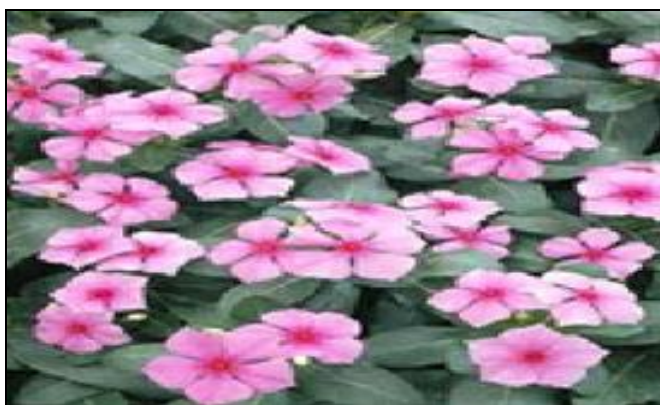
FIG. 4: CATHARANTHUS ROSEUS