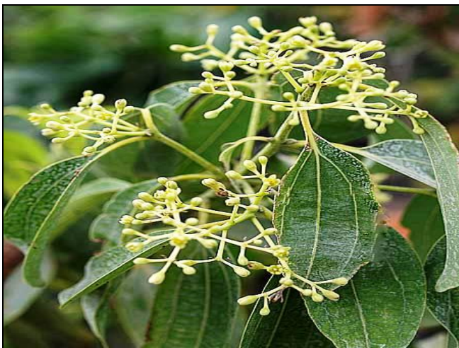
FIG. 12: CINNAMONUM ZEYLANICUM

A compound Cinnamaldehyde isolated from C. zeylanicum bark. The oral administration of a Cinnamaldehyde compound (20mg/kg) significantly decreased the HbA1C, serum total cholesterol, triglyceride levels and at the same time markedly increased plasma insulin, hepatic glycogen and high density lipoprotein cholesterol levels in streptozotacin-induced diabetic rats 19 . It also restored the plasma enzyme reduction in blood glucose level 20 .