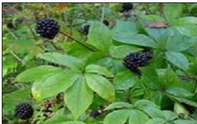
FIG. 5: ACANTHOPANAX SENTICOSUS

A hot water extract (85-95°C) of A. senticosus stem bark significantly decreased the plasma glucose level without affecting plasma insulin levels and inhibited \alpha -glucosidase activity in diabetic mice. The addition of A. senticosus extract inhibited \alpha -glucosidase activity but not \alpha -amylase activity. Thus it would be useful as an ingredient of functional foods to improve postprandial hyperglycemia and prevent type II diabetes mellitus 7 .