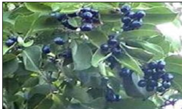
FIG. 16: SYZYGIUM CUMINI

Mycaminose a compound isolated from the plant S. cumini seed extract. Oral administration of a compound (50 mg/kg), ethyl acetate (200 mg/kg) and methanol extracts (400 mg/kg) of fruits and leaves of S. cumini reduced the blood glucose level of streptozotacin-induced diabetic rats 25 . S. cumini seed powder and ethanol extract S. cumini seed have potential antihyperlipidemic effect in type 2 diabetic model rats 26 .