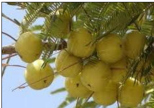
FIG. 10: EMBLICA OFFICINALIS

leaves are simple, light green, sub-sessile, closely set along the branchlets looks like pinnate leaves; flowers are greenish yellow; fruits are globose, fleshy, pale yellow with six obscure vertical furrows enclosing six trigonous seeds in two seeded three crustaceous cocci. Amla is highly nutritious and is one of the richest sources of Vitamin-C, amino acids and minerals. It contains several chemical constituents like tannins, alkaloids and phenols. Oral administration of ethanolic extract of seed powder of E. officinalis decreased the blood glucose level and serum cholesterol level in alloxan induced diabetic rats 17 .