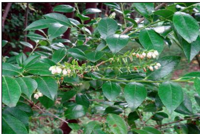
FIG. 9: VACCINIUM BRACTEATUM

Intragastric administration of the aqueous and ethanolic extract of V. bracteatum leaves significantly ameliorated the body weight, blood glucose, insulin and plasma lipid levels of streptozotacin induced diabetic mice 15 . The effect of V. bracteatum aqueous extract on the diabetic mice was superior to that of V. bracteatum ethanolic extract 16 .