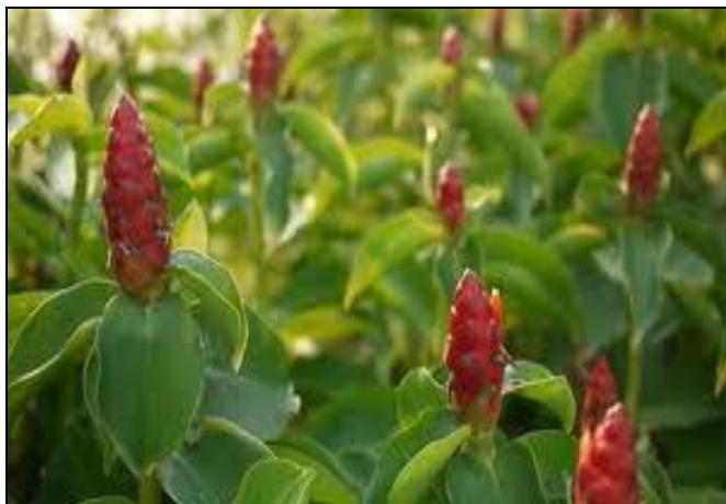
FIG. 8: COSTUS SPECIOSUS

triglyceride, LDL-cholesterol level and at the same time markedly increased plasma insulin, tissue glycogen, HDL-cholesterol and serum protein of streptozotacin induced diabetic rats. It also restored the plasma enzyme levels to near normal. Thus it – possessed a significant hypoglycemic and hypolipidemic activities and hence it could be used as a drug for treating diabetes 15 .