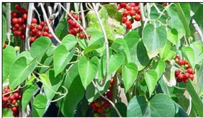
FIG.7: TINOSPORA CORDIFOLIA

It is found in forests throughout India and is widely used in Ayurveda as tonic, vitalizer and as a remedy for DM and metabolic disorders 11,12 . Oral administration of the water extract of Tinospora cordifolia root (2.5, 5 and 7.5 mg/kg) caused a significant reduction in blood glucose, brain lipid level, hepatic glucose-6-phosphatase, serum acid phosphatase, alkaline and lactate dehydrogenase and increase in body weight, total hemoglobin and hepatic hexokinase in alloxanized diabetic rats (150 mg/kg, IP) 13 . Oral administration of 400 mg/kg of aqueous extract of TC for 15 weeks of treatment showed maximum hypoglycemia of 70.37, 48.81 and 0% in mild (plasma sugar /180mg/dl), moderate (plasma sugar / 280mg/dl) and severe (plasma sugar /400mg/dl) diabetic rats, respectively. Hypoglycemic effect depended upon the functional status of the pancreatic beta cells 14 .