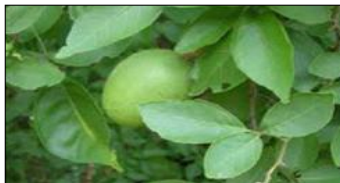
FIG. 19: AEGLE MARMELOS

Antidiabetic potential of the leaves and callus of A. marmelos was reported in streptozotocin induced diabetic rabbits. All the extracts reduced the blood sugar level in streptozotocin diabetic rabbits, however, among the various extracts, the methanol extracts of the leaf and callus brought about the maximum anti-diabetic effect. The methanolic extract of leaf and callus powder of A. marmelos significantly decreased the blood sugar level of streptozotocin induced diabetic rabbits 32 . A. marmelos would act like insulin in the restoration of blood sugar and body weight to normal levels in rat and was therefore recommended as a potential hypoglycemic agent 32 .