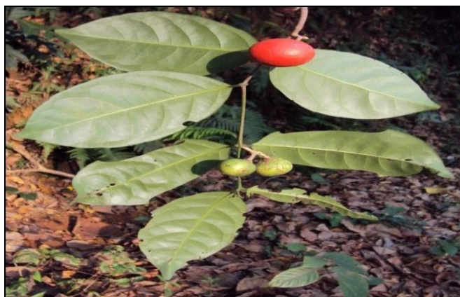
FIG. 3: SALACIA OBLONGA

mg/kg) in albino rats 4 . Petroleum ether extract of the bark of the root has been shown to prevent streptozotacin (65 mg/ kg) induced hyperglycemia and hypoinsulinemia in rats. The aqueous-methanolic extract of the roots inhibited increase in serum glucose level in sucrose and maltose loaded rats. The water-soluble and ethyl acetate soluble portions of the same extract showed inhibitory activities 5 on alpha-glucosidase and aldose reductase 5 .