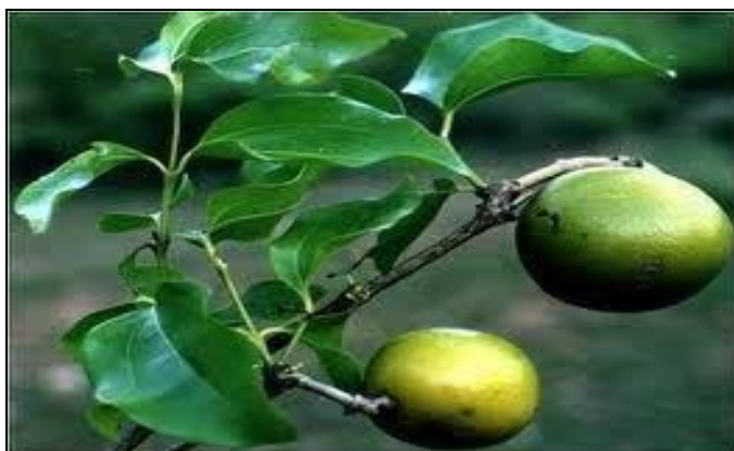
FIG. 13: STRYCHONOUS POTATORUM

from 14 IU/l. The total serum protein level also increased up to 5 mg/ml in the extract treated animal. The insulin level also increased up to 61µg/ml within 30 days of extract treatment compared to control with 51µg/ml. The plant extract efficiently decreased the initial cholesterol 219 µg/ml level into 170µg/ml. In liver, the AST, ALT and ALP enzymes were decreased to 160, 60, and 140 IU/l from 178, 79, and 156 IU/ml respectively 22 .