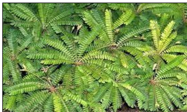
FIG.17: BIOPHYTUM SENSITIVUM

Hypoglycemic effect was studied in the alloxan diabetic male rabbits of different severities: subdiabetic (alloxan recovered; AR), mild diabetic (MD) and severely diabetic (SD). Following single dose administration, there was fall in 1 h and 2.5 h glucose values by 25.9% and 27.4%, respectively, in the subdiabetic rabbits, and by 36.9% and 37.7%, respectively, in the mild diabetic rabbits 28 . Oral administration of the ethanolic extract of B. sensitivum whole plant significantly decreased the blood glucose level, serum cholesterol level and increased the total protein level of alloxan induced diabetic rats 29 .