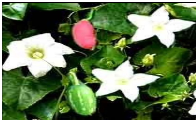
FIG. 6: COCCINIA INDICA

synthetase activity and reduction of phosphorylase activity 10 .