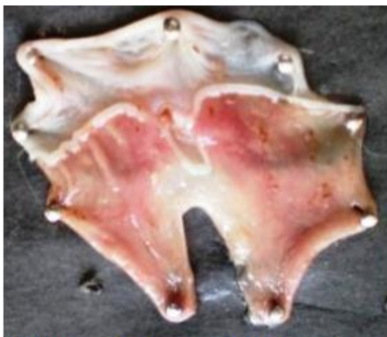
FIG. 1: CONTROL (ASPIRIN 400MG/KG)

The study elucidates that AL has significant anti-ulcer effect by virtue of its anti-secretagogue and antacid/acid neutralizing activities on experimental animals with ulcer induced by aspirin ( Fig. 1-6 ).