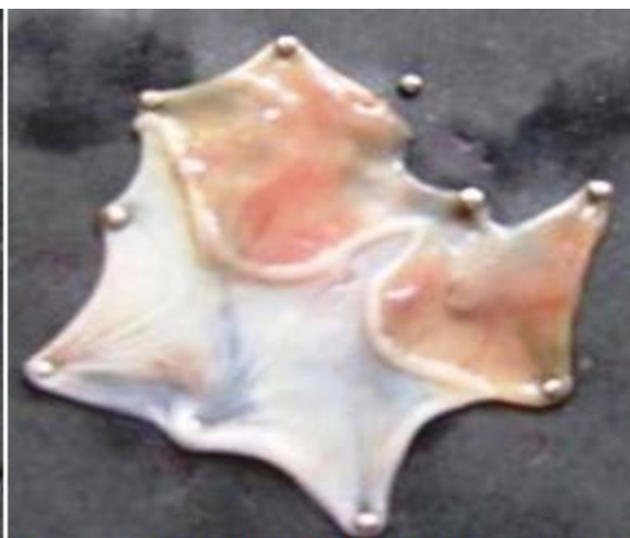
FIG. 2: STANDARD (OMEPRAZOLE 10 MG/KG)