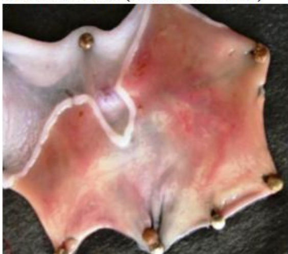
FIG. 3: ANDA LEGHYAM (250MG/KG)