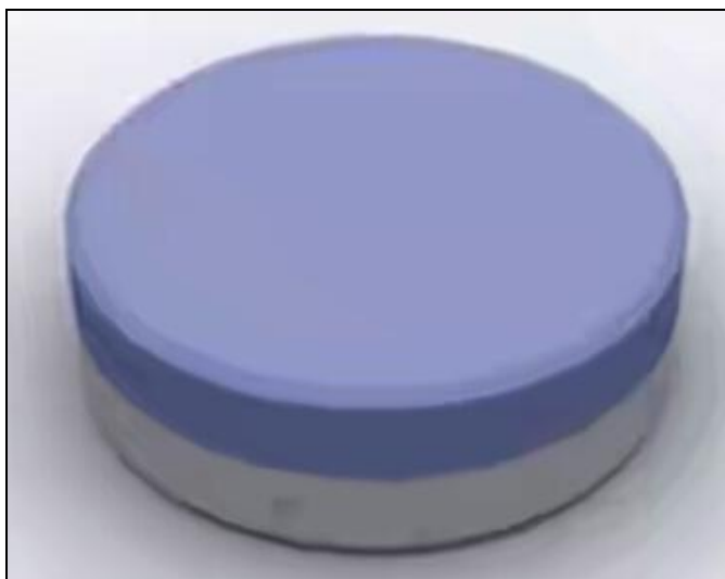
FIG. 1: BILAYER TABLET 32

Best Optimised Approach: From above study we come to know that bilayer tablet is the most suitable approach to avoid physical and chemical incompatibility between drugs. Bi-layer tablets can be a primary option to avoid chemical incompatibilities between APIs by physical separation, and to enable the development of different drug release profiles (immediate release with extended release). 31