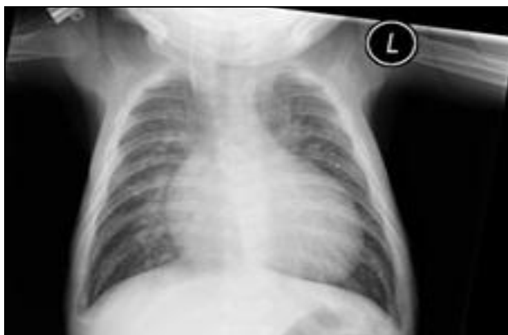
FIG. 2: CHEST X-RAY AT DAY 53, FIRST INCIDENCE OF SMOOTH PERIOSTEAL REACTION ALONG THE RIBS, CLAVICLES AND PARTIALLY VISUALIZED HUMERII