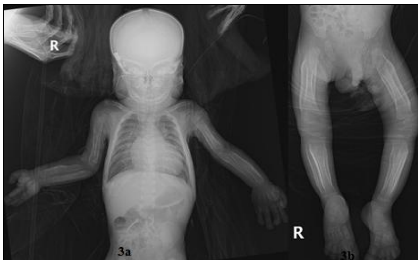
FIG. 3a AND 3b: EXTENSIVE PERIOSTEAL REACTION ALONG THE LONG BONES

DISCUSSION: Elliot used prostaglandins in congenital cyanotic heart disease in 1975 to keep the ductus arteriosus patent 1 . E-type prostaglandins (PGE), prostaglandin-E1 (PGE1, injection form) and prostaglandin-E2 (PGE2, oral form) have been documented as being effective in maintaining the patency of ductus arteriosus in neonates with congenital ductal-dependent heart diseases 2 .