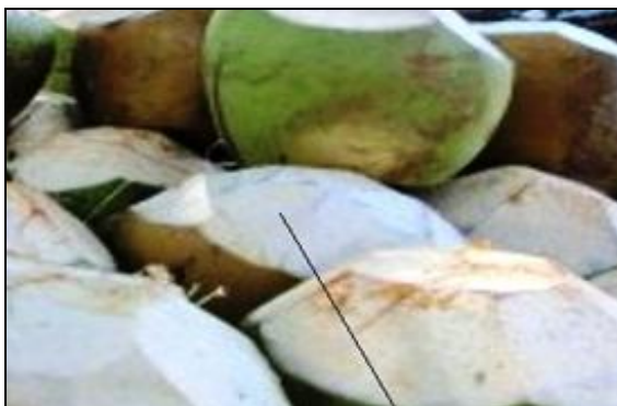
FIG. 2: ORDINARY GREEN COCONUT