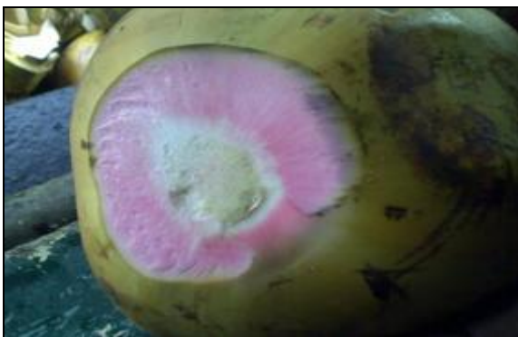
FIG. 1: WULUNG GREEN COCONUT

Coconut ( Cocos nucifera Linn.), shaped like an egg or ellipse, varies in size, There are several varieties, different varieties have slightly different flavors. It consists of a network of fibrous outer layers called coconut husk (mesocarp) that covers a hard layer called a shell (endocarp). In the shell, there is a nucleus (endosperm) which is believed to be the most important part of the coconut. Below are examples of the morphology of types of green coconut ( Vidity viridis ) of ordinary type and 'wulung.'