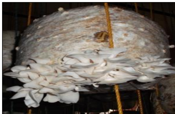
FIG. 5: THE PICTURE REPRESENTS THE OYSTER MUSHROOM PLEUROTUS OSTREATUS

Mushrooms Responsible for Antiatherogenic Activity: Oyster mushroom P. ostreatus exhibited hypocholesteremic effect along with inhibition of lipid peroxidation was observed among rats and rabbits.