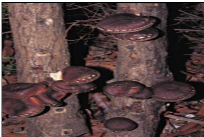
FIG. 4: THE PICTURE REPRESENTS THE EDIBLE SHIITAKE ( LENTINULA EDODES ) FRUITING ON LOGS THAT HAVE BEEN ARTIFICIALLY INOCULATED WITH THE FUNGUS 2

Unfortunately, schizophyllan didn't show any effect upon the survival time when the tumor tissue was not removed 43 . Compound PSK was administered orally (dosage: intravenous application on the day of surgery and 1 day following) for more than 3 years followed by mitomycin C and 5-fluorouracil (orally for 5 months) in another RC study group consisting of 462 patients who have undergone surgical removal from colorectal cancer patients. After four years, the follow-up study was conducted, and it was observed that an increase in the disease-free survival curve of the PSK concerning the control group was found to be statistically significant 44, 45 . A clinical trial with PSP was done among 485 cancer patients (control patients: 211; cancer of esophagus, stomach, and lung). PSP was administered at a dosage rate of 3g/day oral for 30 days, and it was observed that the side effects from the conventional therapy Co 60 – gamma radiation, DT 65-70 Gy per 6-7 months were significantly lessened. 11% increase in one-year survival rate of patients with esophagus cancer was also observed 44, 46 .