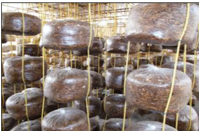
FIG. 2 AND 3: THE PICTURE REPRESENTS THE CULTIVATION PROCESS OF MUSHROOM AND THE SUBSTRATE BED PREPARED WITH STRAW PIECES (1 INCH LENGTH) SOAKED IN LIME WATER FOR ABOUT 12 h AND THEN SEEDED WITH THE INOCULUMS OF MUSHROOM SPORES FOLLOWED BY INCUBATION. THE MYCELIUM GROWS WITHIN 26-27 DAYS WITH THE APPEARANCE OF FRUIT BODY ROUGHLY WITHIN 27 DAYS

Previous literature records revealed that water hyacinth ( Eicchornia crassipes Solms.) had been used as raw material for the production of oyster