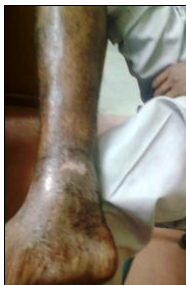
FIG. 3: VENOUS ULCER AFTER TREATMENT