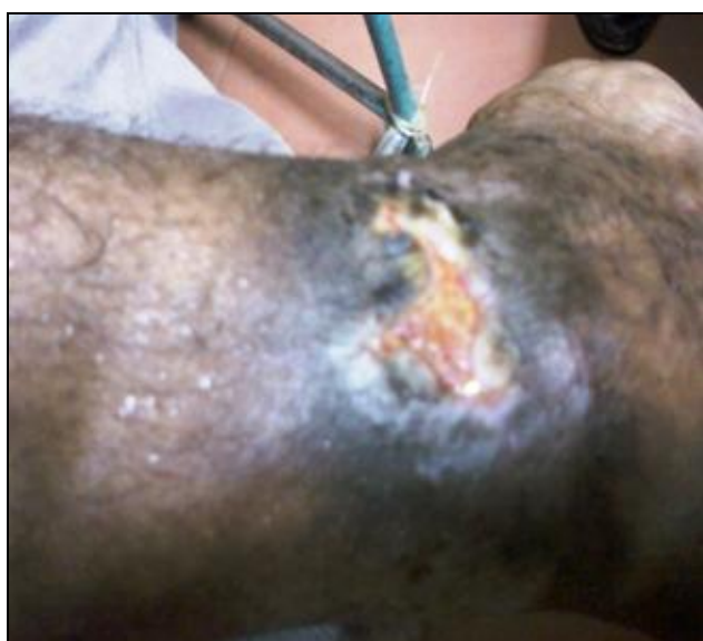
FIG. 1: VENOUS ULCER BEFORE TREATMENT