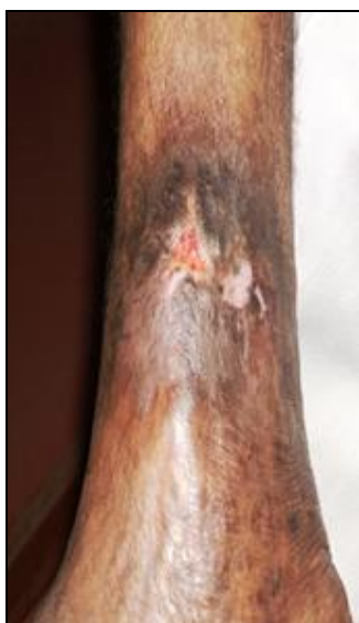
FIG. 2: VENOUS ULCER DURING TREATMENT

DISCUSSION: After scrutinizing the case, I diagnosed the venous ulcer due to professional hazard but the person must continue his profession. Homoeopathic medicine can successfully treat the venous ulcer and varicose vein. All the diseases known to man have their likeness in the Materia Medica and the physician must be so conversant with this art that he may perceive this likeness. All the senses must be on the alert in order to perceive that which similar, and most similar 4. After taking of the case, finding out totality of the symptoms, I selected similimum and before prescribing, I verified every time with Materia Medica .