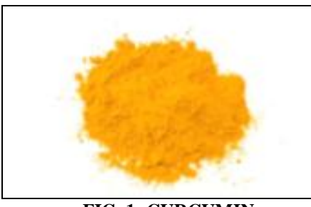
FIG. 1: CURCUMIN

The curcuminoids, which Vogel originally isolated in 1842, give turmeric its distinctive yellow colour. An orange-yellow crystalline powder known as curcumin is essentially water insoluble. In 1910, Lampe and Milobedeska provided the first description of the curcumin ( C_{21}H_{20}O_6 ) chemical structure and established that it is diferuloylmethane<sup>7</sup>. Turmeric powder has recently