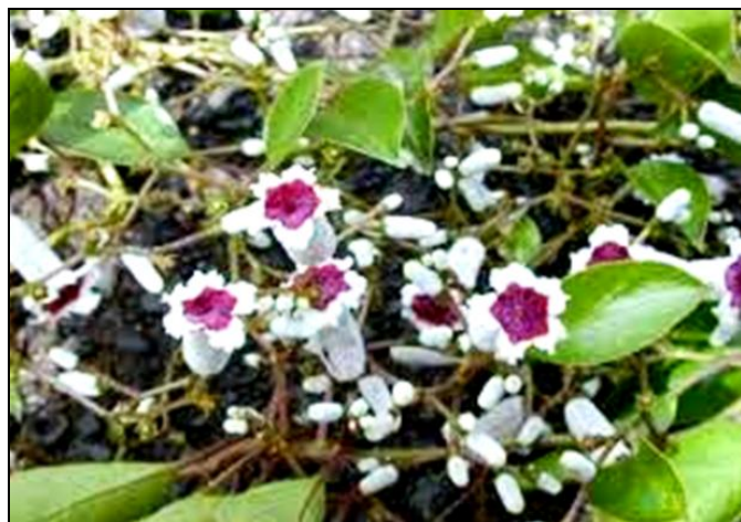
FIGURE 1: PAEDERIA FOETIDA PLANT

The inflorescence consists of a terminal or axillary cymose panicle that is extremely variable. It grows from widely branched paniculate over 1m long to rather reduced size, normally 10cm long. The bracts are either leaf-like or small and linear, with few to numerous flowers, often in lax coiled cymes with peduncle that is 2-30mm long 8 . The flowers are bisexual, usually 5-merous; in dirty pink or lilac or purplish colour (see Figure 1 ). The corolla lobes are pinkish to whitish on the inside while the throat is dark purple. The sepal is bell-shaped, with 5 normally smooth triangular-lobed with sizes up to 1mm x 0.6mm.