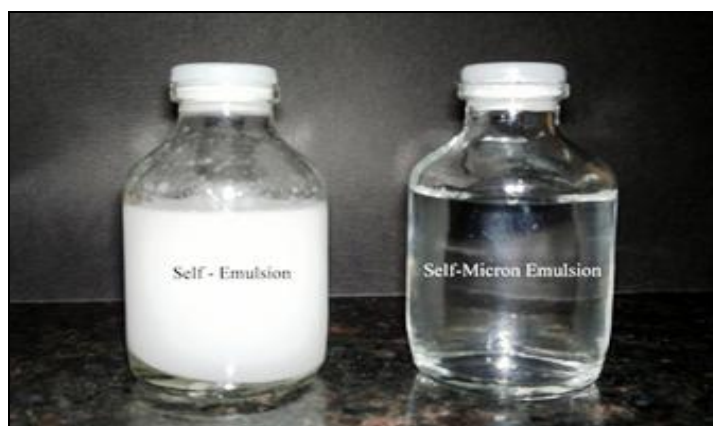
FIGURE 1: DIFFERENCE BETWEEN SELF-EMULSIONS AND SELF-MICRON EMULSION

Self- Micron Emulsifying Drug Delivery Systems: Self-micron emulsifying drug delivery systems (SMEDDS) are mixtures of oils, co-solvents and surfactants, which is isotropic in nature and which emulsify spontaneously to produce fine oil-in-water emulsions when introduced into aqueous phase under gentle agitation. After per oral administration, these systems form fine emulsions (or micro emulsions) in gastro-intestinal tract (GIT) with mild agitation provided by gastric mobility and it has a droplet size between 10–200 nm, transparent than those of conventional emulsions (1 – 20 \mu\text{m} ) which is opaque ( Fig. 1 ). These are stable preparations and improve the dissolution of the drug due to increased surface area on dispersion and solubility effect of surfactants 5 .