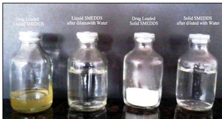
FIGURE 4: LIQUID SMEDDS VS SOLID SMEDDS BEFORE AND AFTER DILUTED WITH WATER

Polymers or Nanoparticle adsorbents, for example, silica, silicates, magnesium trisilicate, magnesium hydroxide, talcum, crospovidone, cross-linked sodium carboxymethyl cellulose and cross linked polymethyl methacrylate. Cross-linked polymers create a favorable environment to sustain drug dissolution and also assist in slowing down drug reprecipitation. Nanoparticle adsorbents comprise porous silicon dioxide (Sylsila 550), carbon nanotubes, carbon nanohorns, fullerene, charcoal and bamboo charcoal 18 .