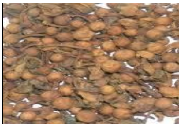
FIG: 1 MESUA FERREA (PLANT & FLOWERS)