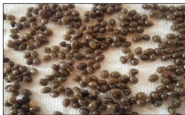
FIG: 2 CARICA PAPAYA (PLANT & SEEDS)