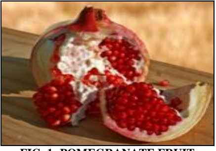
FIG. 1: POMEGRANATE FRUIT

believed that the pomegranate was one of the first cultivated fruits for its beneficial properties. Pomegranate was held sacred by many of the world's major religions and nations. In the Holy Quran, pomegranate has been described as a paradise fruit and a symbol of insurgence and life everlasting in Christian art. In China, pomegranate is widely represented in art symbolizing fertility, posterity, abundance, numerous and virtuous offspring, and a blessed future. It was also a symbol of invincibility in battle by the Persians<sup>7-9</sup>. For over 4,000 years, human beings have culti vated pomegranate for its medicinal properties. Juice, seeds, leaves, flowers, bark and roots of pomegranate have various effects. Lowering fever, treating diabetes, anthelmintic, anti-diarrhea, blood tonic, stopping the bleeding, and healing ulcers are the most important traditional uses of pomegranate 10-14