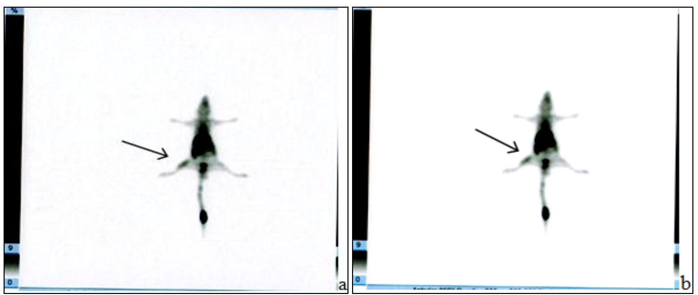
FIG. 2: SCINTIGRAPHY IMAGING

All images were observed and interpreted by three independent nuclear physicians and their final opinion was achieved by consensus. This study was double-blind and therefore, the observers were unaware about the nature of induced injuries on the rat's foot. The quantitative analysis has been performed after imaging assessment. The rats were sacrificed by diethyl ether and the organs of interest such as affected foot, contra lateral healthy side foot, kidneys, liver, stomach, spleen, intestine, bladder, heart, and lungs removed and weighted. The relative activity of each organ to the interest organs was calculated. The results have been obtained from this analysis, stated in Table 1 .