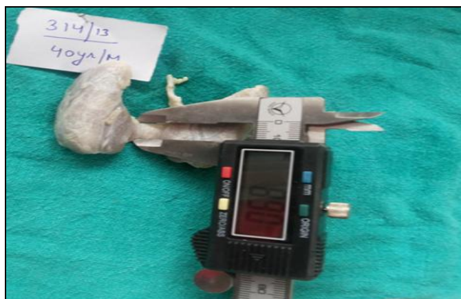
FIG. 4: SHOWING MEASUREMENT OF HEIGHT OF ISTHMUS THE THYROID GLAND WITH DIGITAL VERNIER CALIPER

Statistical Analysis: The data obtained was analyzed using SPSS 17.1 software. The One Way Anova test was applied to compare the age related changes in the morphometry of the thyroid gland. The p-value \leq 0.05 was considered as significant.