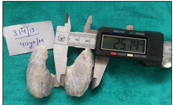
FIG. 2: SHOWING MEASUREMENT OF WIDTH OF LEFT LOBE OF THE THYROID GLAND WITH DIGITAL VERNIER CALIPER