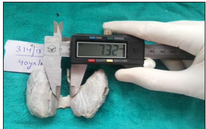
FIG. 3: SHOWING MEASUREMENT OF LENGTH OF ISTHMUS OF THE THYROID GLAND WITH DIGITAL VERNIER CALIPER