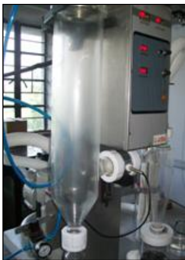
FIG. 1: SPRAY DRYER

The excipients used for the spray dry were starch and maltodextrin solution. The viability at different combination was carried out for starch and maltodextrin solution as 1:1, 1:2, 2:1, etc to check for good results.