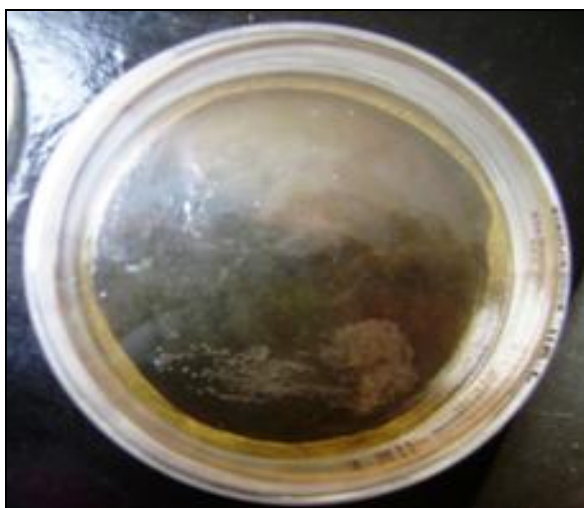
FIG. 3: PLATE OF L. ACIDOPHILUS ON MRS MEDIA WITHOUT DILUTION

pH Survival Studies: The effect of pH on growth of microbes was as follows: