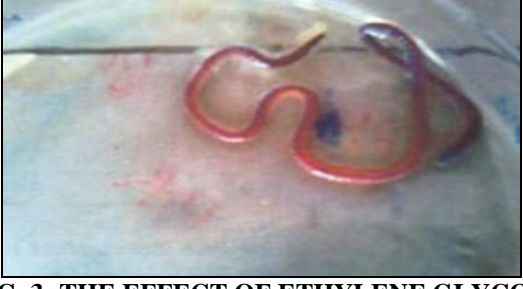
FIG. 3: THE EFFECT OF ETHYLENE GLYCOL EXTRACT ON PHERETIMA POSTHUMA