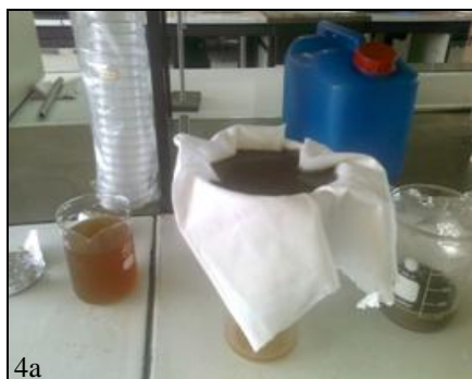
FIG. 4a: FILTRATION SETUP OF OBTAINING GLUCOSE SYRUP FROM THE WORT