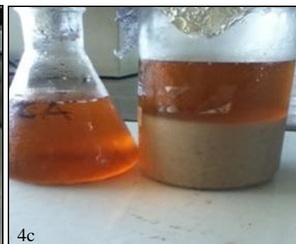
FIG. 4c: GLUCOSE SYRUP SAMPLE (SORGHUM)