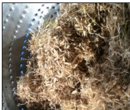
FIG. 1: MALTED RICE

samples every 24 h. These samples were used to analyze for amylase activity. The malted grains were weighed and put in the oven to dry at low temperature of 50 °C for 3 days. After complete drying they were de-rooted by rubbing in between the two palms to get roots off. The rootlets were sieved and weighed. The malt were weighed, milled with a blender into fine powder and stored in a cool dry place.