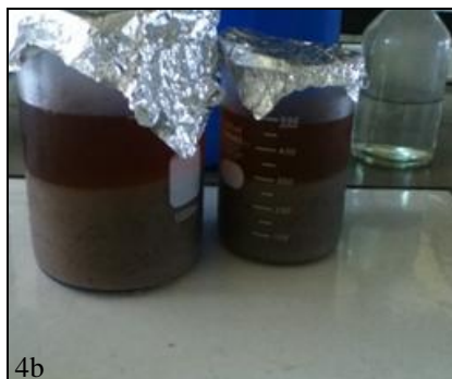
FIG. 4b: GLUCOSE SYRUP SAMPLE (MAIZE)