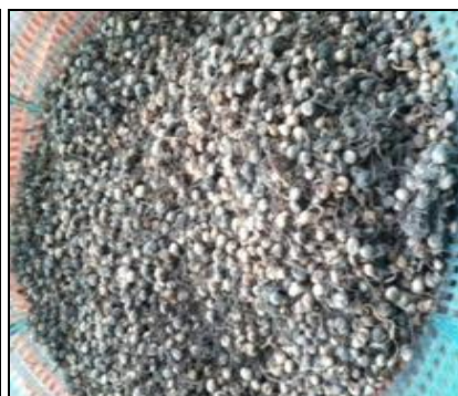
FIG. 3: MALTED SORGHUM

Extraction of Carbohydrate: The carbohydrate content was extracted with 50% methanol which was prepared by mixing methanol and distilled water at a volume ratio 1:1.