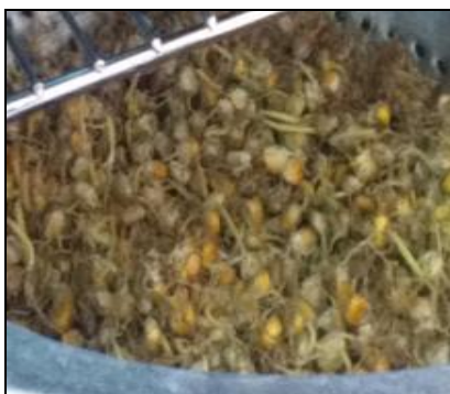
FIG. 2: MALTED MAIZE