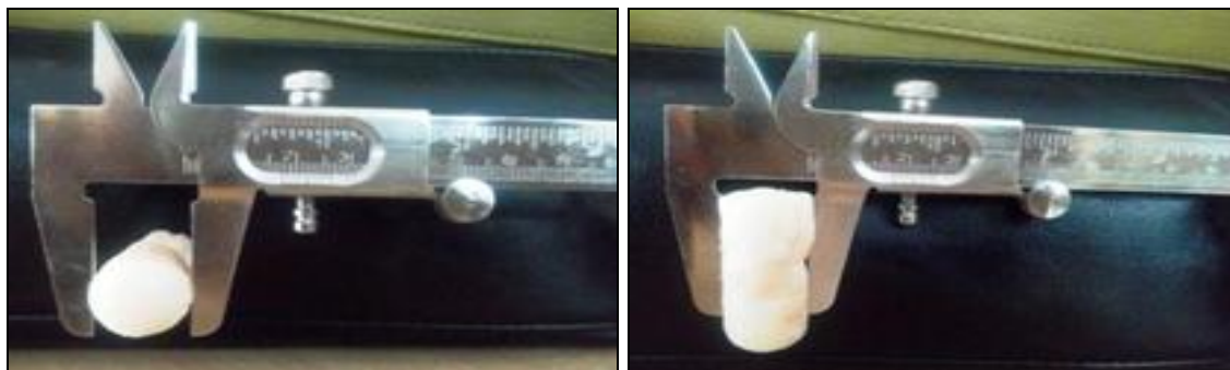
FIG. 2: SIZE DETERMINATION BY VERNIER CALLIPERS

few bubbles and agnate significantly curtailed porosity.