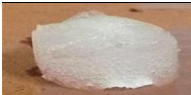
FIG. 3: PHOTOGRAPH OF SUPERPOROUS HYDROGEL SWOLLEN STATE

Density and Swelling Studies: SPH's synthesized by exploiting conglomerate agent like polyvinyl chloride were domineer to concretion and abscess property (Contusion Time, Contusion Ratio) characterization. SPHC was optimized for farther depiction through water confinement studies it was espied that lower the concentration of the crosslinking agent, the faster was the loss of water from the super porous hydrogel.