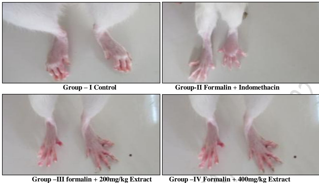
FIG. 1: EFFECT OF MERREMIA TRIDENTATA ON FORMALIN INDUCED PAW EDEMA IN RATS

Effect of Merremia tridentata on Histamine Induced Paw Edema in Rats: From the analysis of Histamine induced paw odema, the paw volume of the control group was found to be 4.5 \pm 0.42 ml at the 0 min, 8.0 \pm 0.22 ml at the 5 h and 7.9 \pm 0.29 ml at the 6 th h Table 2 .